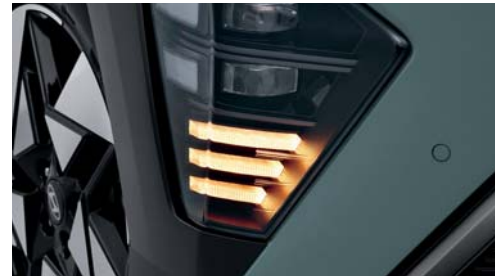
LED turn signal indicators (front/rear)