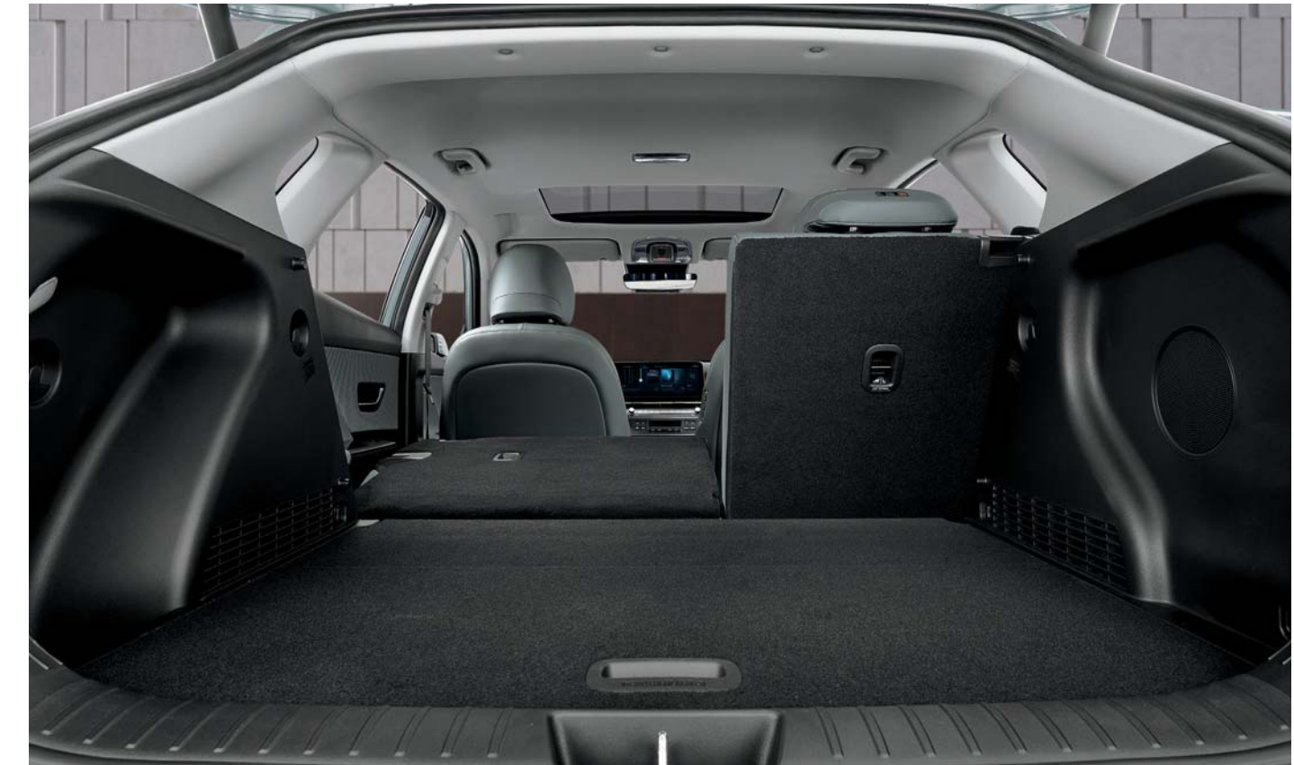
6:4 folding 2nd row seat backs