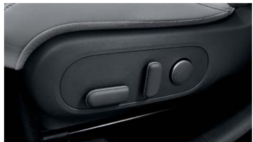
Powered driver seat