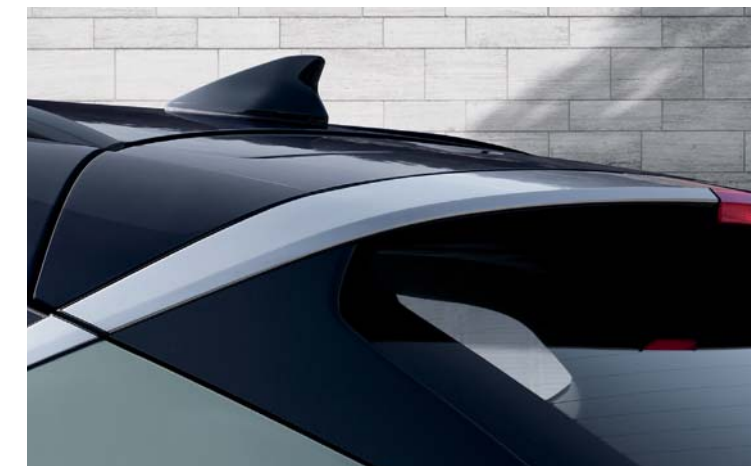
Dual tone roof, sharp connecting chrome line