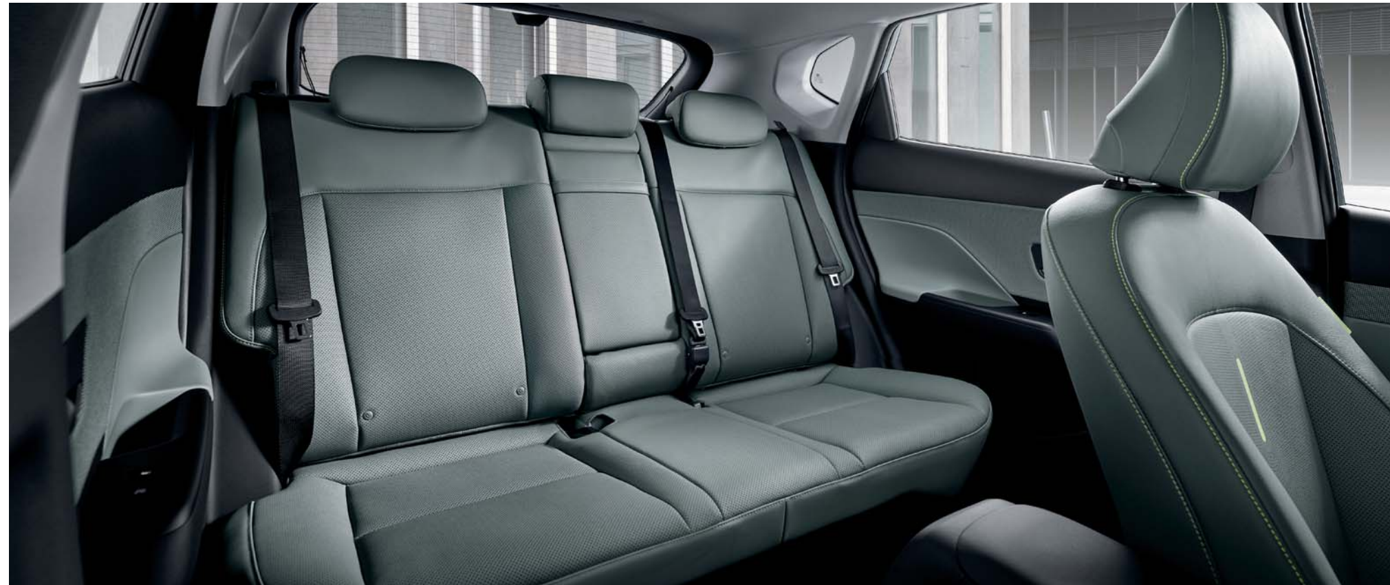
2nd row space

KONA's interior is practical and spacious, with a focus on the comfort of rear passengers and ample luggage space to cater to different lifestyles.