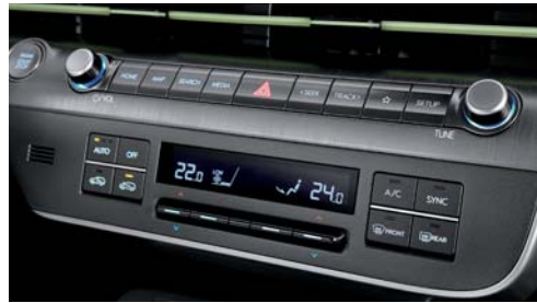
Full auto air conditioning system