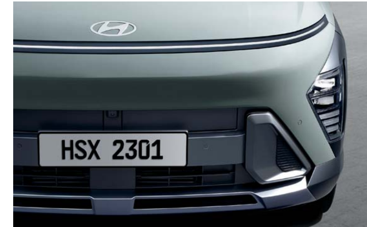
Front seamless horizon lamp, front bumper