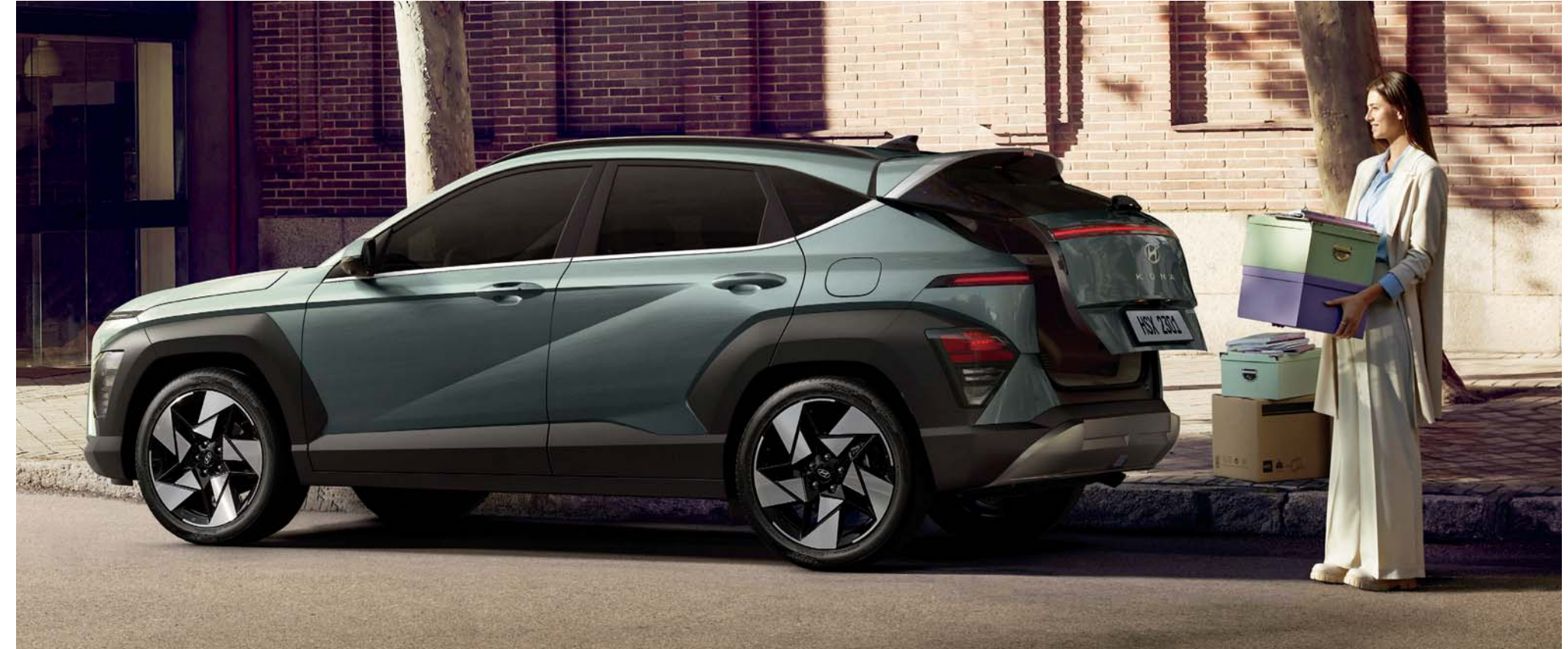
Smart power tailgate - Hands-free smart liftgate with auto-open and adjustable height setting