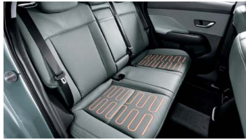
Heated rear seats