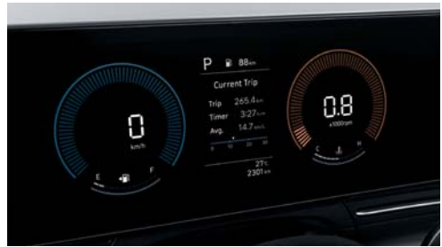
Cluster display (4-inch color LCD)