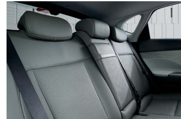
2nd-row seatback 2-step latch