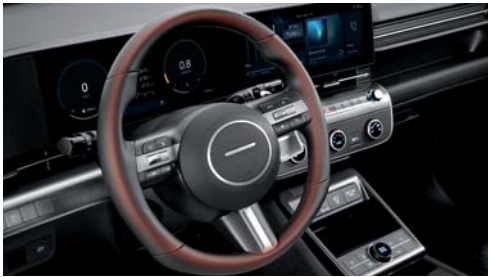
Heated steering wheel