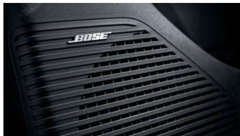
Bose premium audio system