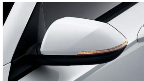
Outside mirror (Heated / Folding / Turn signal indicator LED)