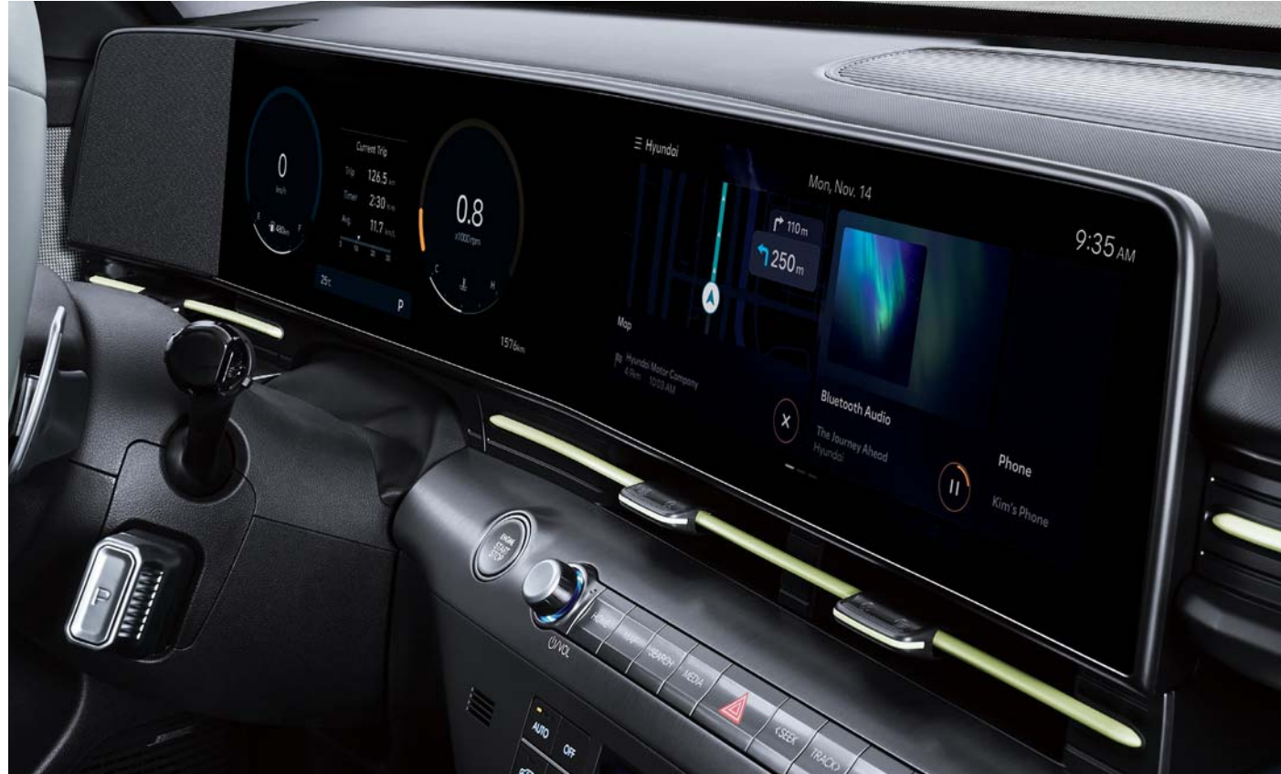
Panoramic display - 12.3-inch integrated dual screen display

The panoramic display - 12.3-inch integrated dual screen display and cutting-edge driver assistance technology offer high-tech convenience and increase user satisfaction in daily use.