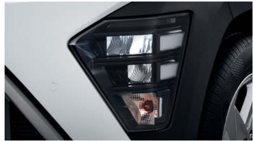
LED Headlamps (MFR)