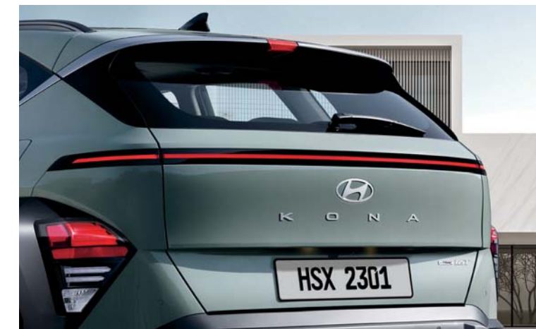
Spoiler Integrated HMSL, rear seamless horizon lamp LED brake lamps, LED turn signal lamps