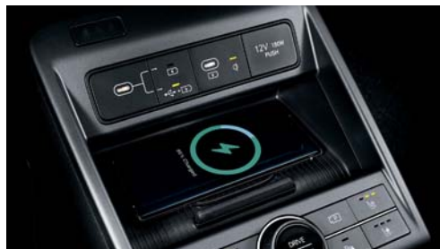
USB-C Data/Charging ports /Wireless charging pad