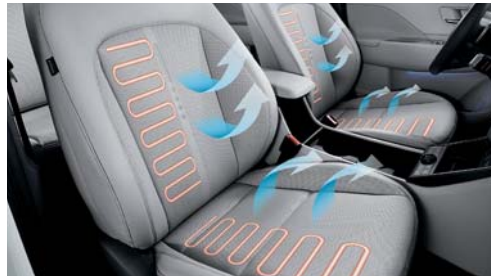
Heated & Ventilated front seats