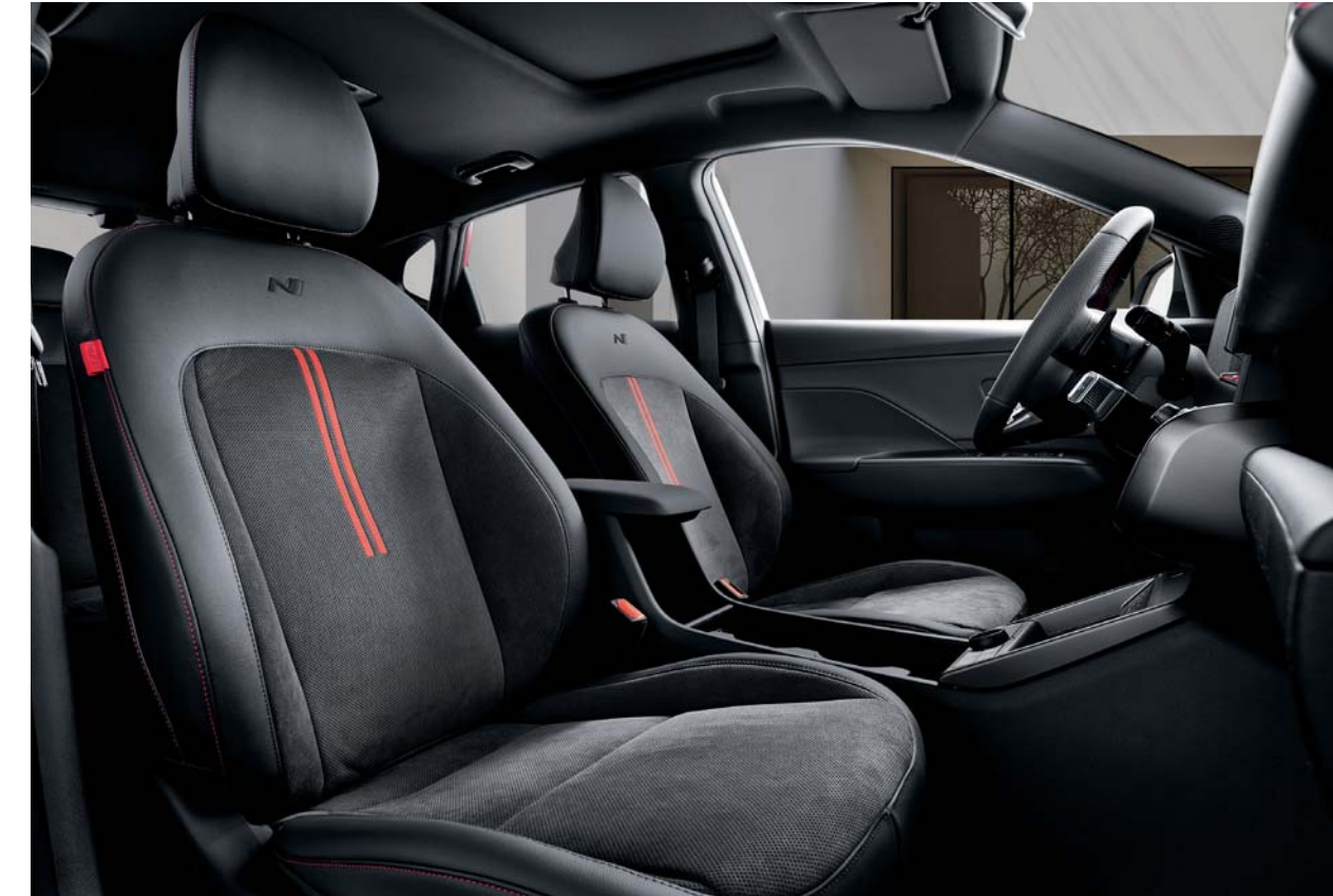
N Line-exclusive authentic leather / Alcantara combination seats