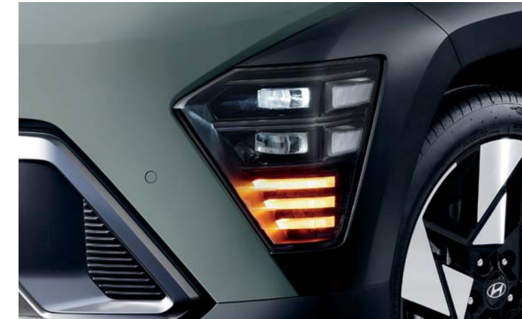
Full LED headlamps (projection type)