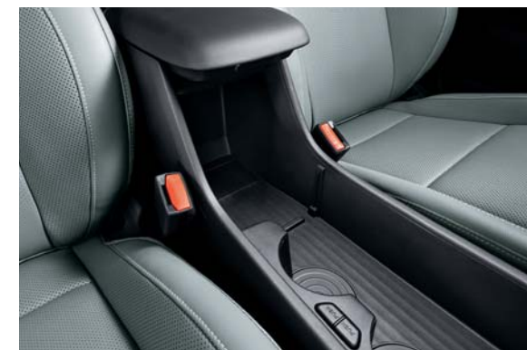
Open console storage (removable bulkhead / rotational cup holders)