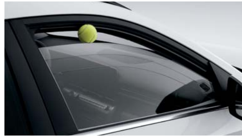
Safety power window